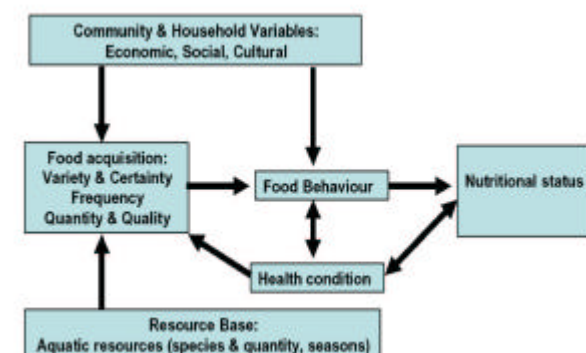
Figure 1. Linking aquatic resources to nutritional status

‘Nutritional status’ is the result of the interaction of a number of variables, which are shown in Figure 1. This conceptual framework was used as the basis for understanding the links between health and nutrition and aquatic resources. In this framework, the aquatic resource base is the source from which food is acquired and is expressed in terms of variety and certainty of acquisition, frequency, quantity and quality.