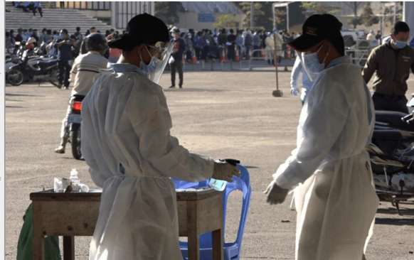
A health worker sprays alcohol sanitizer on a colleague at the Covid-19 testing center at Olympic Stadium in Phnom Penh on December 8, 2020.

Locked-down casinos in a Kandal province commune have seen more than 100 Covid-19 cases, including 64 new ones on Friday, but the commune chief said the danger is sealed off from the rest of the community.