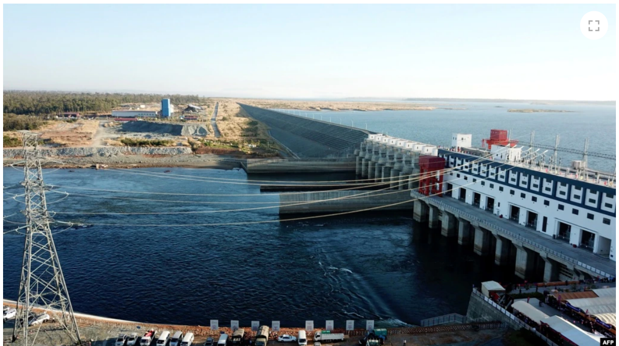
FILE - A fishing boat passes near a construction site of the Don Sahong dam, near Cambodia-Laos borders, in Preah Romkel village, Stung Treng province, northeast of Phnom Penh, Cambodia, June 20, 2016.

Experts in Cambodia have welcomed the government's recent halt on hydropower development on the Mekong River until 2030, but called on the government to focus on renewable energies.