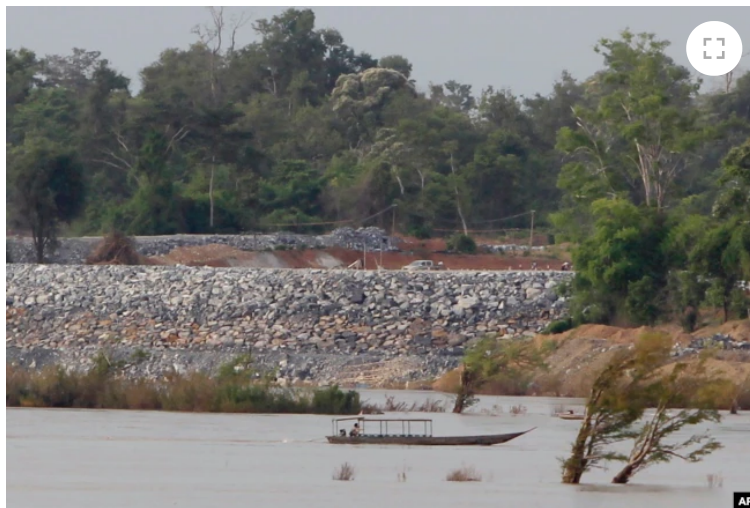
FILE - A fishing boat passes near a construction site of a dam, near Cambodia-Laos borders, in Preah Romkel village, Stung Treng province, northeast of Phnom Penh, Cambodia, June 20, 2016.

Other tributaries, however, are excluded from this halt. For example, an 80 megawatt plant in Stung Pursat Province was still on the table, Victor Jona said. The government also did not exclude the possibility of further hydropower projects on the river after 2030.