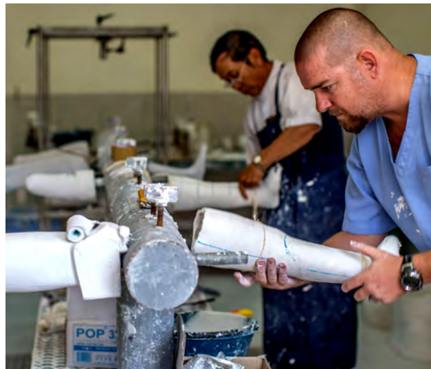
The COPE and CMR P&O staff working together, producing artificial limbs requires concentration and patience.

Although the focus is on prosthetics and orthotics (P&O), there is also an emphasis on ensuring a multi-disciplinary approach in order to provide the necessary services for the patients. COPE continues to strengthen the knowledge and skills of CMR staff related to the multidisciplinary approach of the rehabilitation services, including physiotherapy and occupational therapy. During the year, COPE has worked through three Mentors (P&O, Occupational Therapy and Paediatric Physiotherapy) to build technical skills at the five rehabilitation centres across the country.