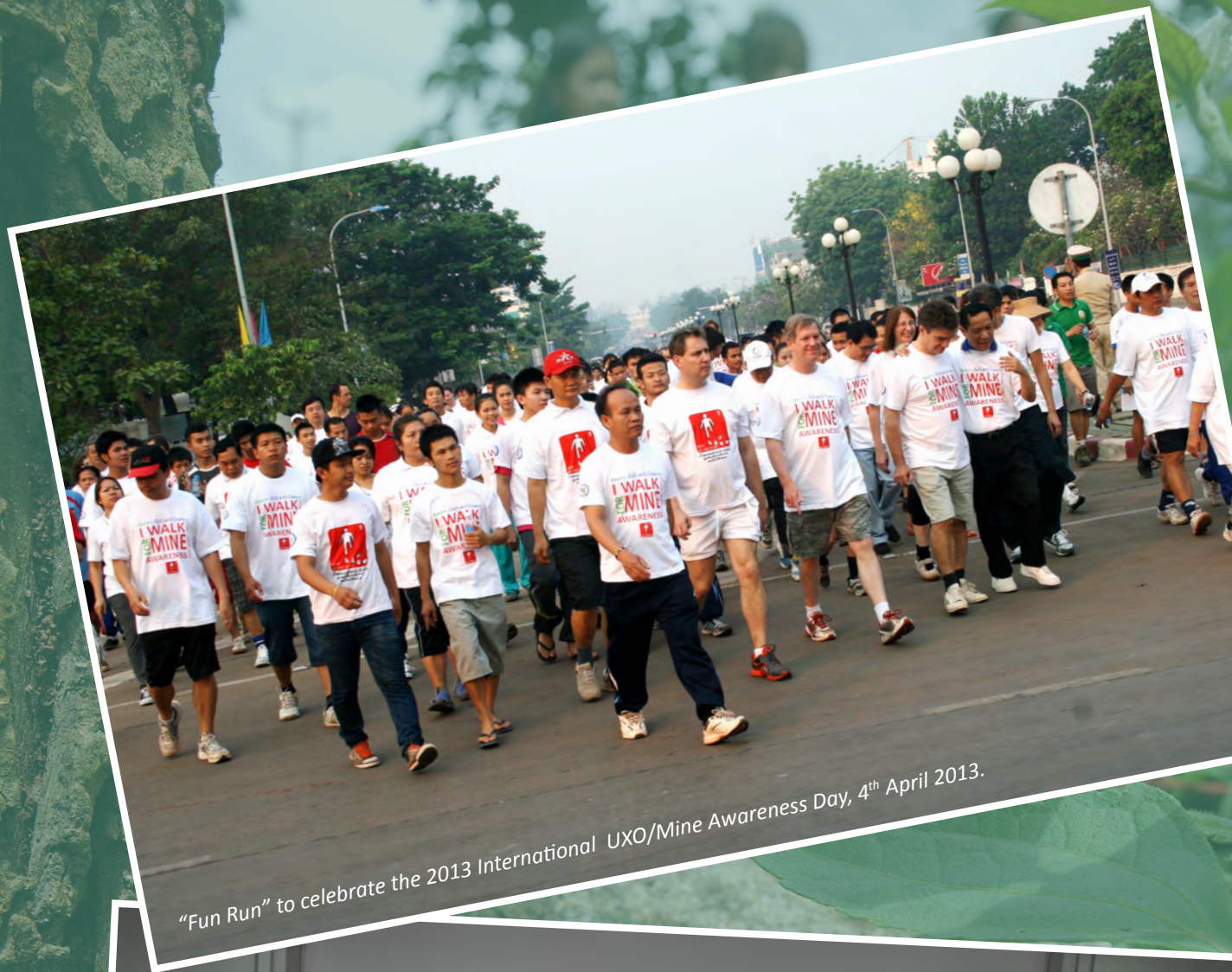
"Fun Run" to celebrate the 2013 International UXO/Mine Awareness Day, 4 th April 2013.