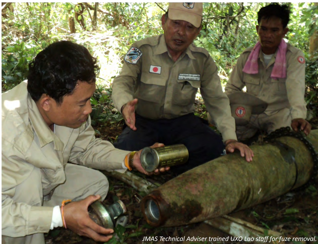
JMAS Technical Adviser trained UXO Lao staff for fuze removal.