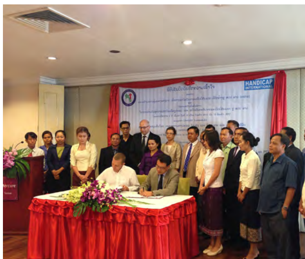
Signing MOU ceremony by NRA and Handicap International at Novotel hotel, Vientiane, July 2013.

Handicap International also pursued its support to the Provincial Office of NRA in Savannakhet, consisting of providing financial support to cover some running costs and strengthening their capacities in managing the budget.