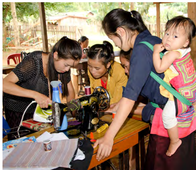
Handicraft training, organized by QLA, in Hai Hin Village.

There are 21 producers groups in 18 villages in Khou, Phaxay, Paek, and Kham Districts for a total of 365 members (which include UXO survivors, people with disabilities and the most poor in the villages). The QLA works closely with the Department of Health, the Xieng Khouang Integrated Vocational Training School and the village administration in these villages to review activities, lessons learned and work plans.