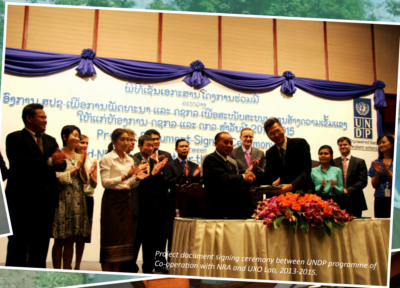
Project document signing ceremony between UNDP programme of Co-operation with NRA and UXO Lao, 2013-2015.