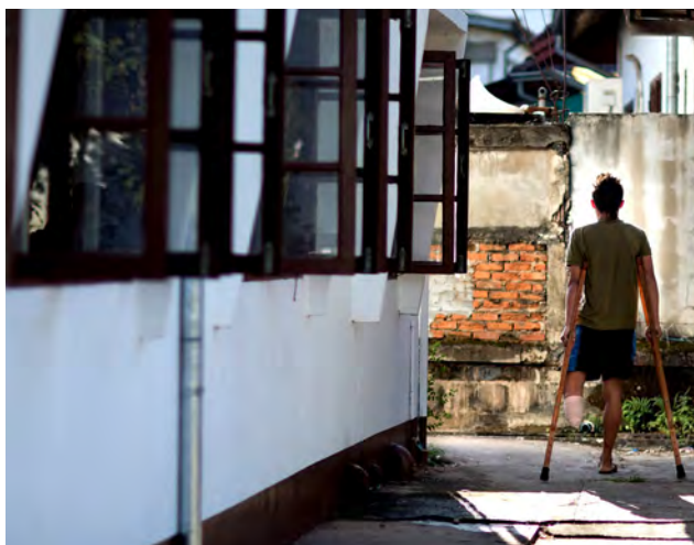
A man who has lost his leg, practicing on crutches outside the Center of Medical Rehabilitation in Vientiane. The process of casting and fitting a new prosthesis, and receiving the necessary training, can take up to two weeks.

seeking treatment where it can take days or weeks to be properly fitted with a device and learn to use it. COPE continued to support expenses of P&O patients, including UXO accident survivors, who are unable to pay for treatment and associated costs such as travel, food and accommodation during their treatment.