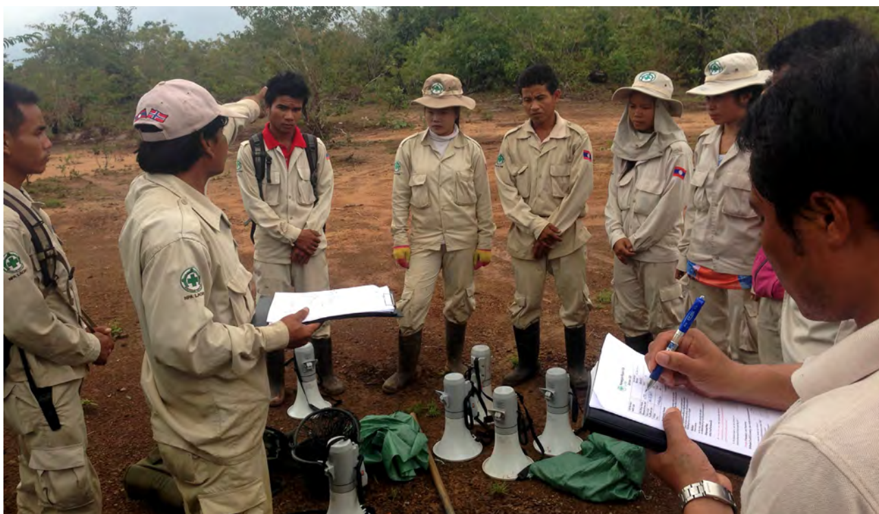
NPA Team Leader Instructs a CMRS Team.