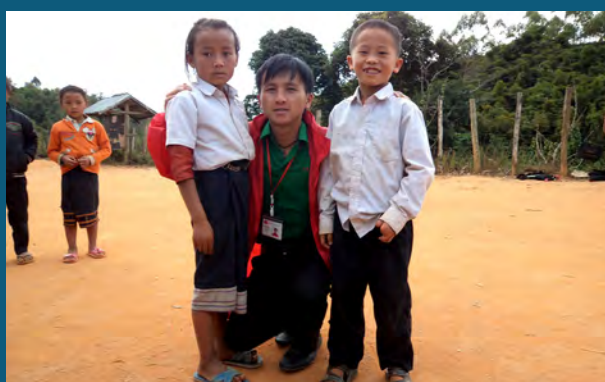
AAR Japan visits UXO victims for data collection. Two children are victims in Kham district.