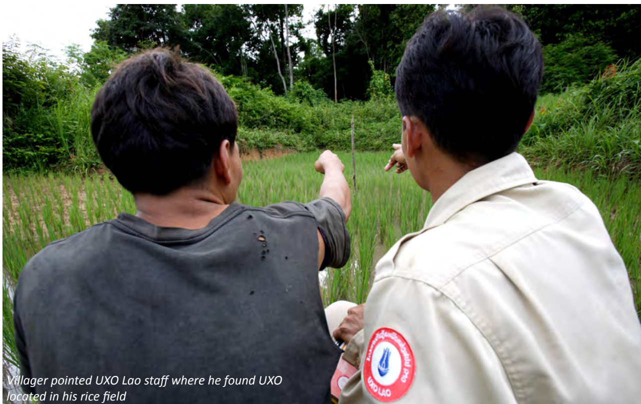
Villager pointed UXO Lao staff where he found UXO located in his rice field