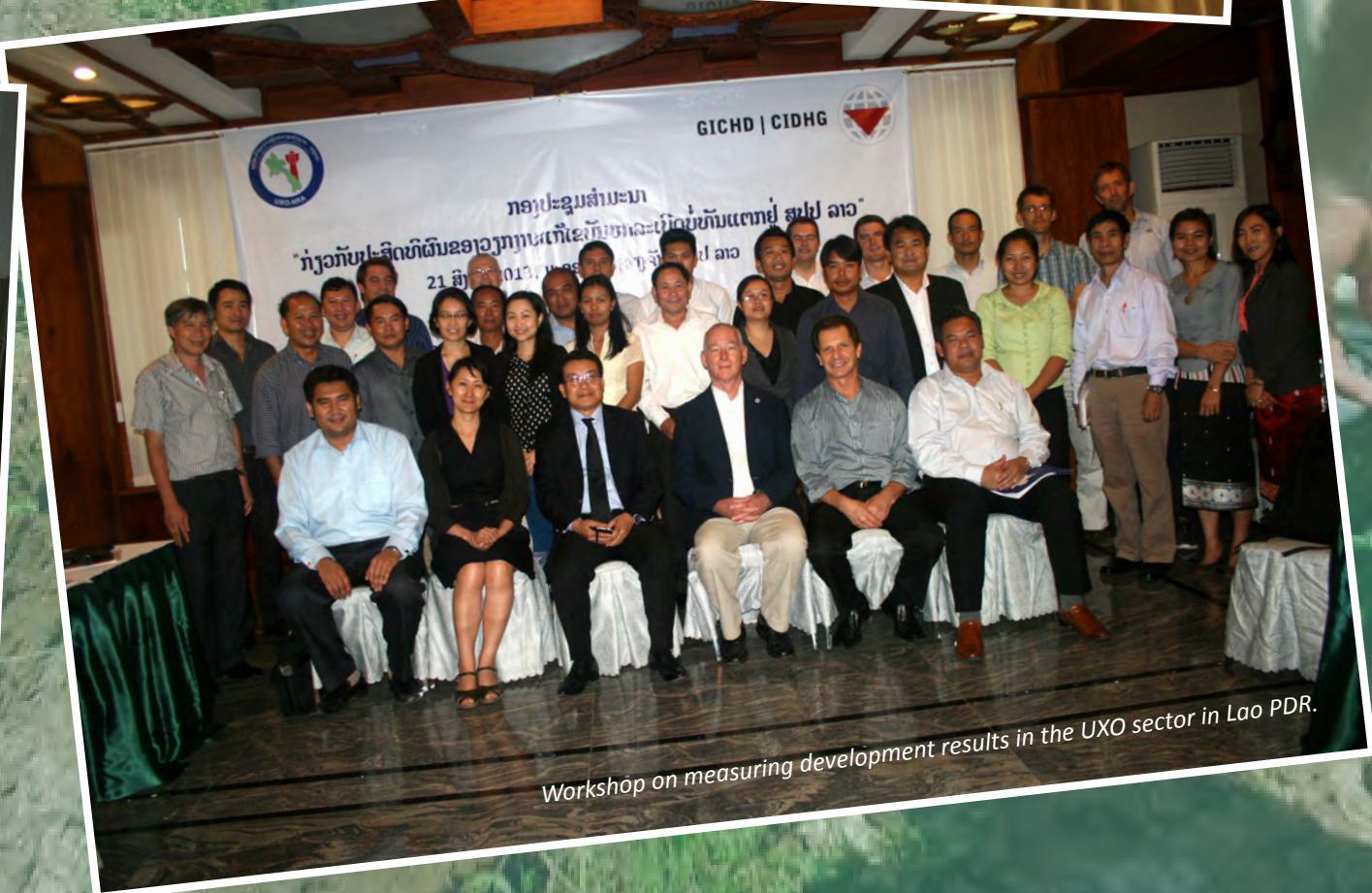
Workshop on measuring development results in the UXO sector in Lao PDR.