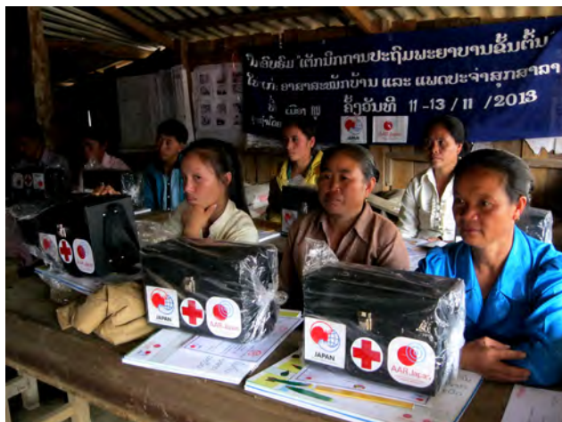
VHVs receive first aid kits, booklets, flipcharts and posters at the end of trainings.

AAR Japan has provided first aid trainings with a focus on injuries resulting from UXO accidents to Health Center Nurses (HCNs) and Village Health Volunteers (VHVs) in Xieng Khouang. AAR Japan has also supported UXO-Lao of its MRE activities by providing MRE materials