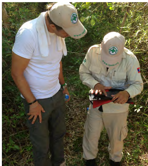
Using Tablet For CMRS Reporting.

We work to develop and maintain a good working relationship with all stakeholders.