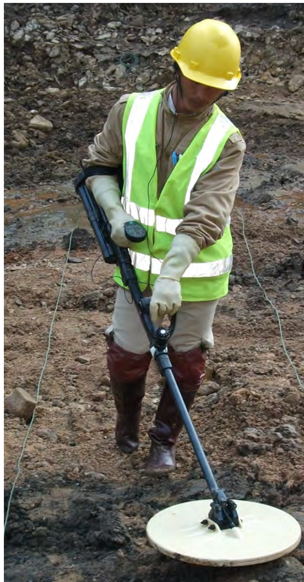
Searching with Minelab large coil.

Milsearch Lao remains committed to long term and ongoing ERW hazard reduction within the Lao PDR and will strive to maintain its reputation as "Asia's Premier UXO & De-mining Company".