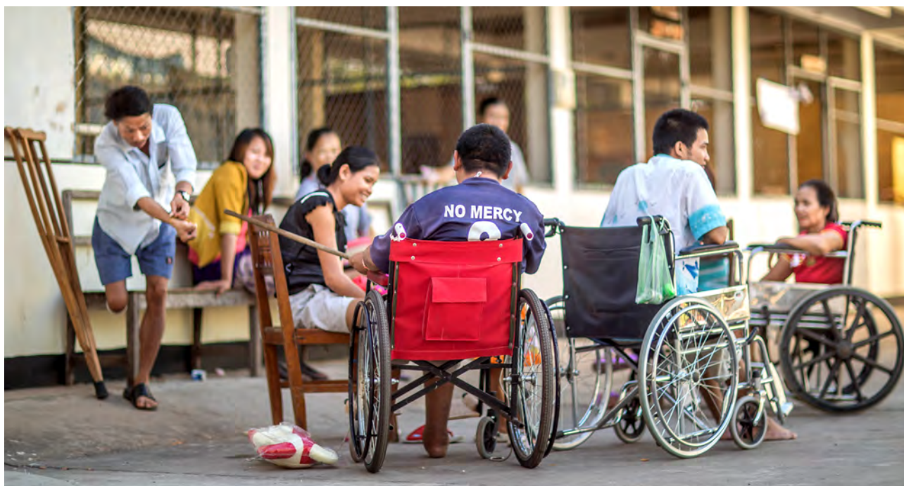
People with different kinds of disabilities spending time together outside of CMR.

The CMR, under the Lao Ministry of Health, was founded in 1963 and is responsible for providing and coordinating rehabilitation services throughout the country. Since the COPE/CMR partnership commenced in 1997, the overall goal of the collaboration is to support the development of technical rehabilitation skills in Laos in a sustainable manner that enables the continuing development of these vital services within the existing Government of Lao PDR infrastructure.