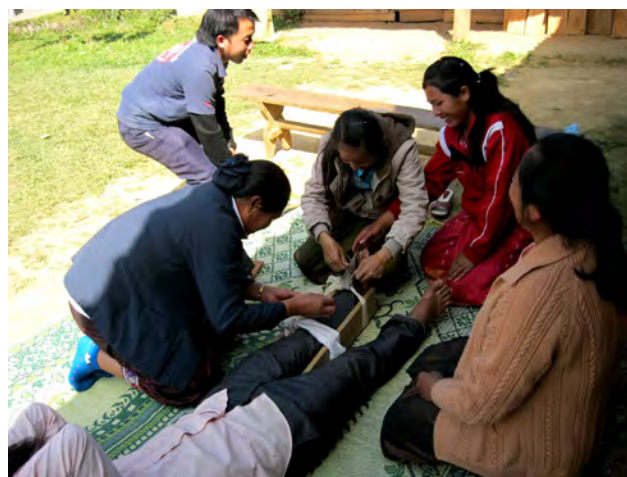
VHV practice the fracture treatment at trainings.