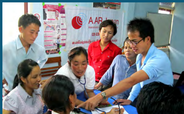
HCNs practice how to take blood pressure at trainings.