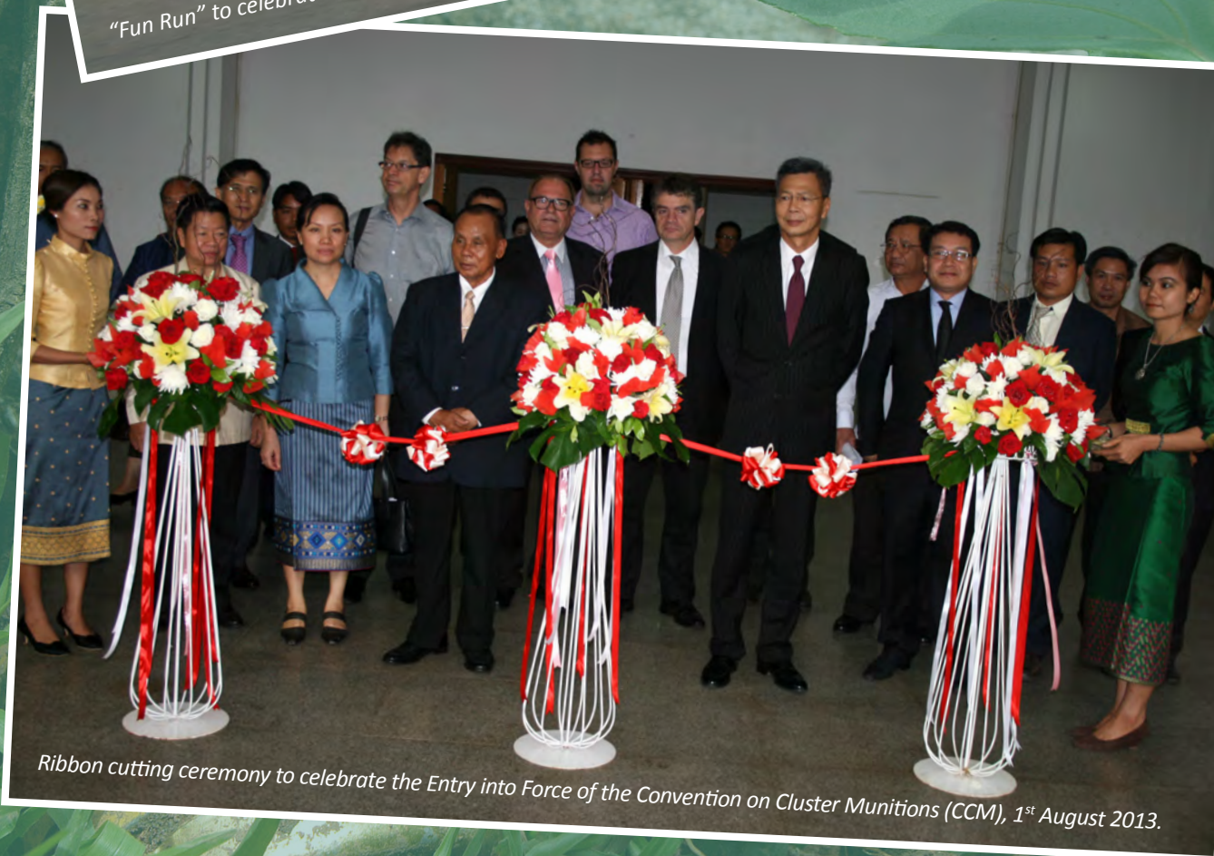
Ribbon cutting ceremony to celebrate the Entry into Force of the Convention on Cluster Munitions (CCM), 1 st August 2013.