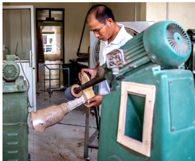
Providing the necessary equipment and technical training to CMR staff is an important part of COPE’s support.

COPE started supporting CMR activities in 1997 and has since then worked to ensure high quality prosthetic and orthotic services for people with needs and are today working through five government rehabilitation centres across the country.