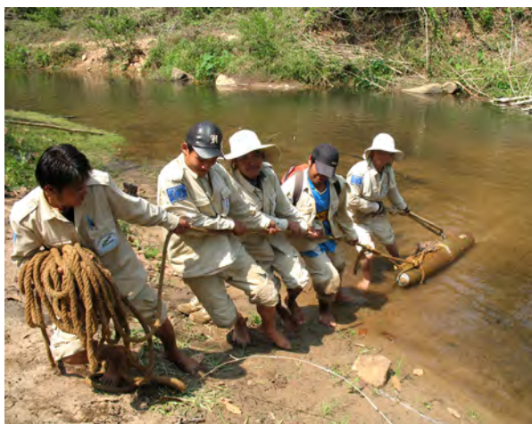
Roving activities, HI, Nong district, 2013