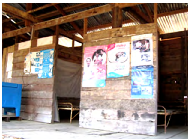
Nakaphor Village health center, which has only one VHV and very few medical supplies.