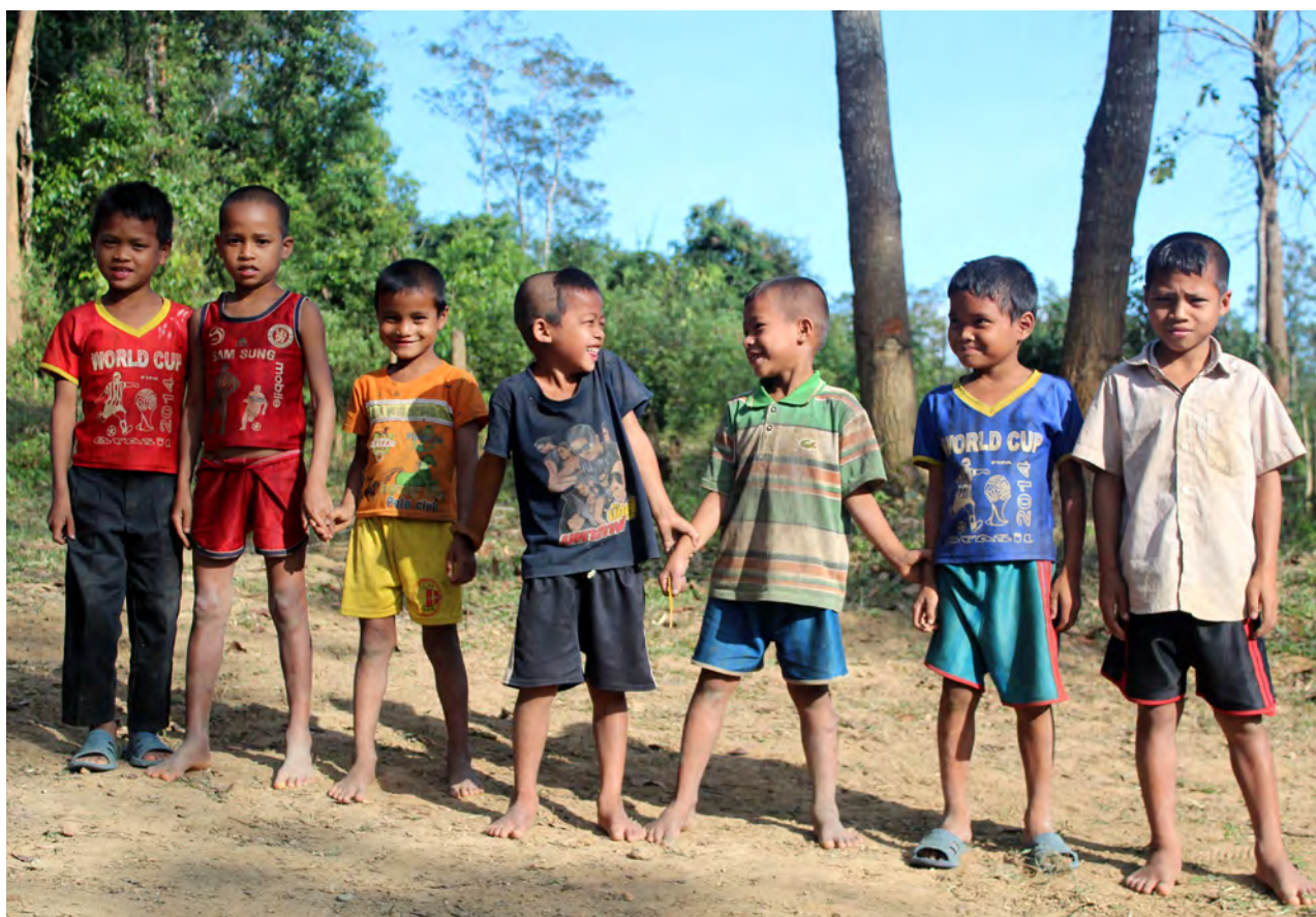
The children in Ban Lateung are now able to safely play again. HALO provided them with Risk Education and conducted (non-) technical survey and clearance in their village.

Additionally, HALO is engaging with entities within and outside the UXO sector to continuously evaluate and improve the standard of operations in general and survey in particular. HALO believes that evaluation and innovation of survey procedures greatly contributes to achieving Millennium Development Goal No 9 in Lao PDR, thereby making the Government of Laos a direct beneficiary of HALO operations.