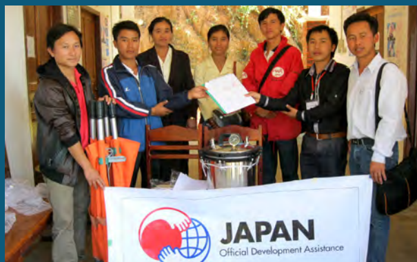
AAR Japan hands over the equipment for trauma care to HCs in the presence of District Hospital staff.