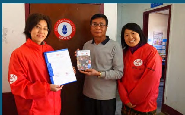
AAR Japan works on an original MRE song to support MRE activities of UXO-Lao Xieng Khouang.